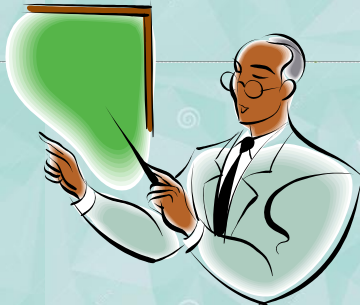
Photo-Ster Exhibition on

Hygiene Haj – Sihasth Road Safety Fire Gadgets Chemical Accident