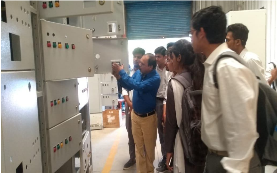
Pic : Interaction during Industrial Visit at Universal Transformer

Third day is dedicated for industrial visits; there were two group of student for industries.