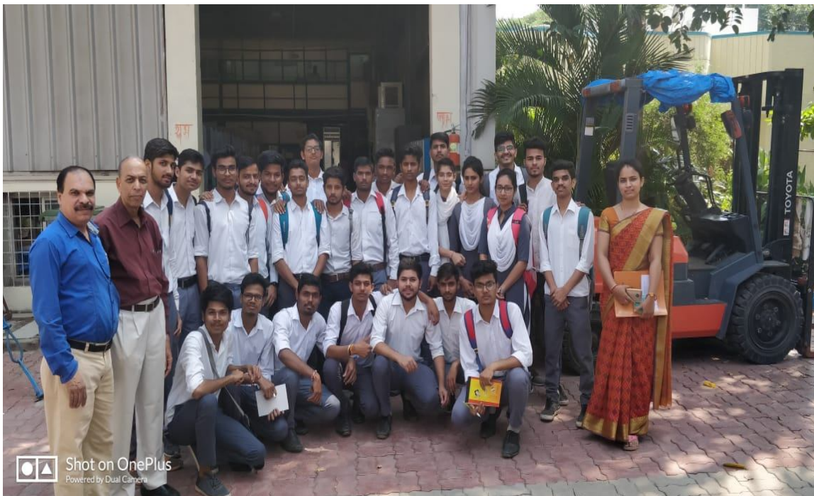
Pic : Industrial Visit at Universal Transformer