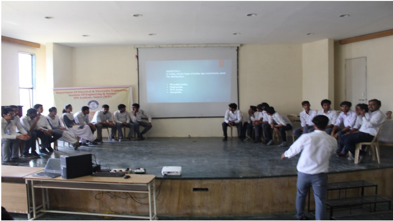
Pic: Technical Quiz competition