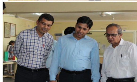
Pic : Project competition