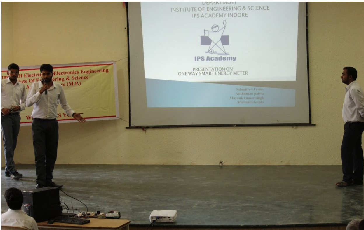
Pic: Paper Presented By the Students