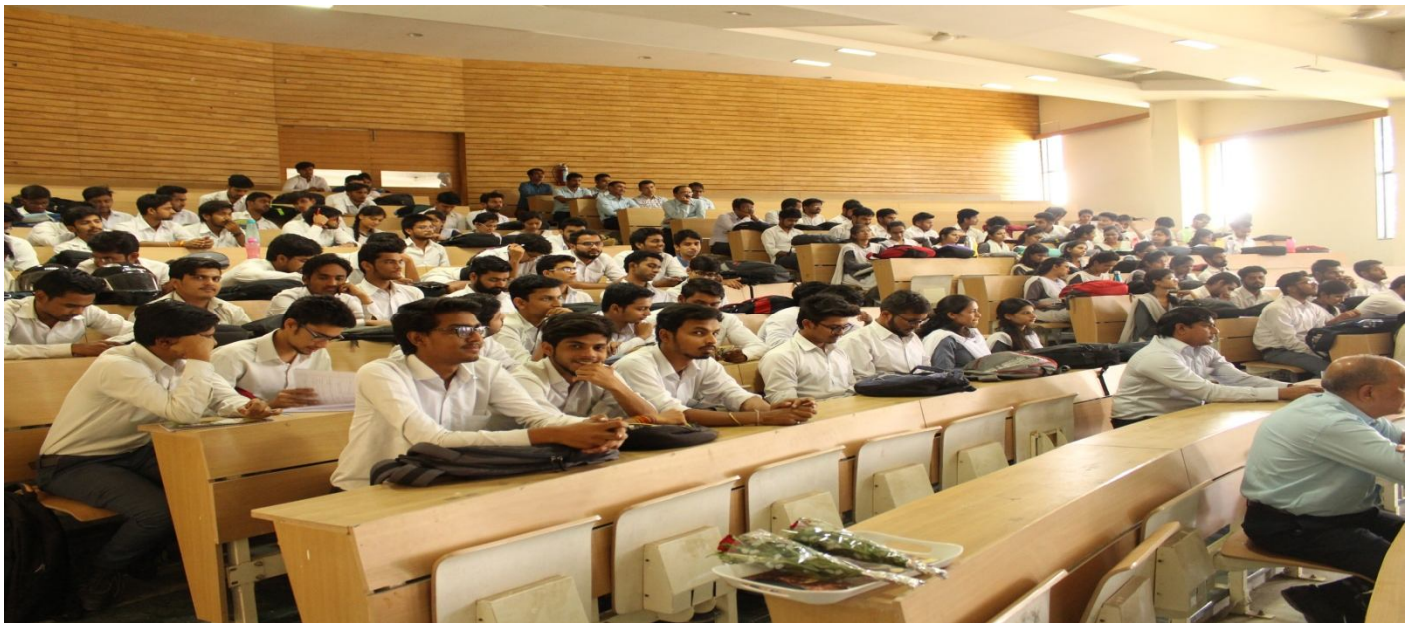
Pic: Lecture attended by Students