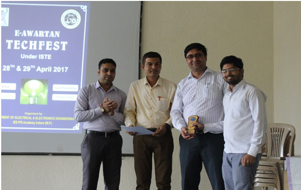
Pic: Prize Distribution