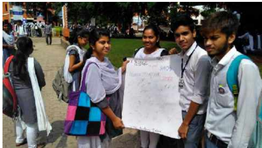
Figure:Student with signed poster