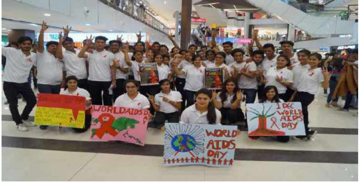
Picture: Student after spread awareness program at TI mall indore