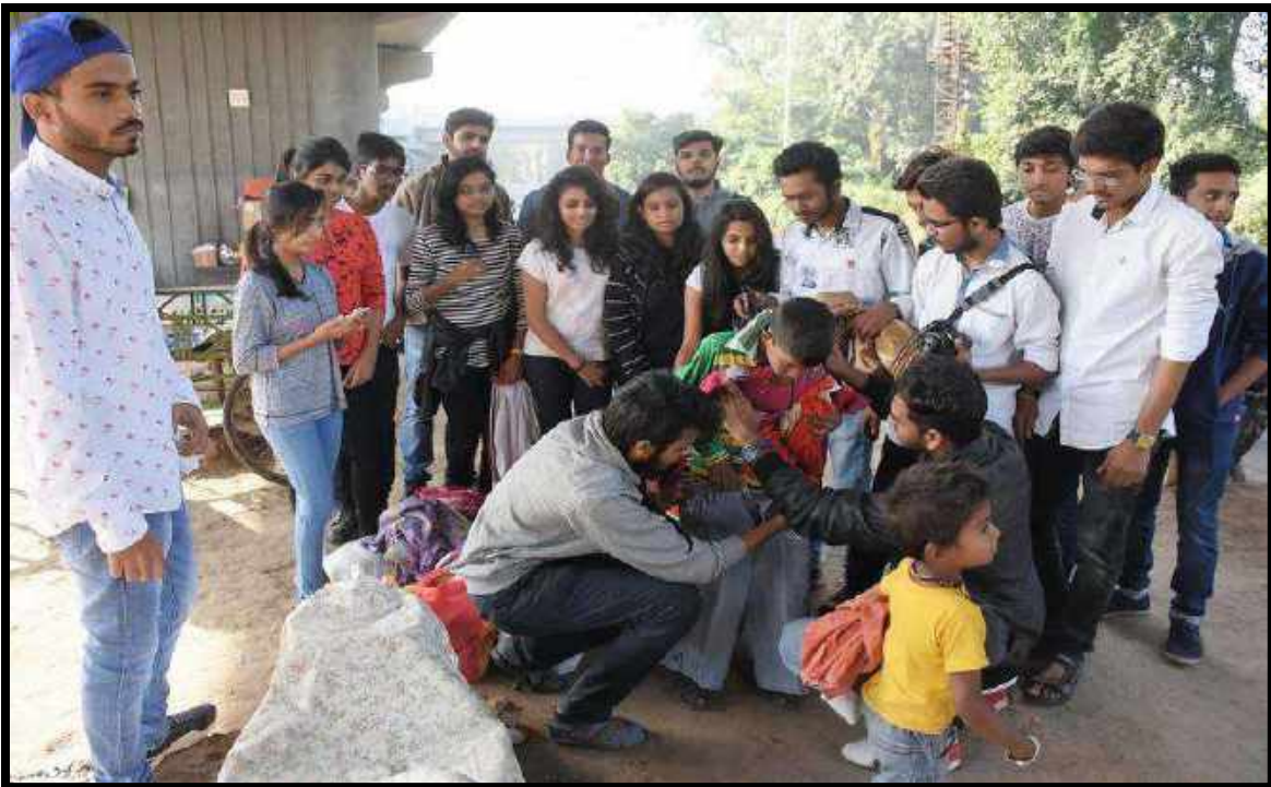
Picture : Distribution of stuff