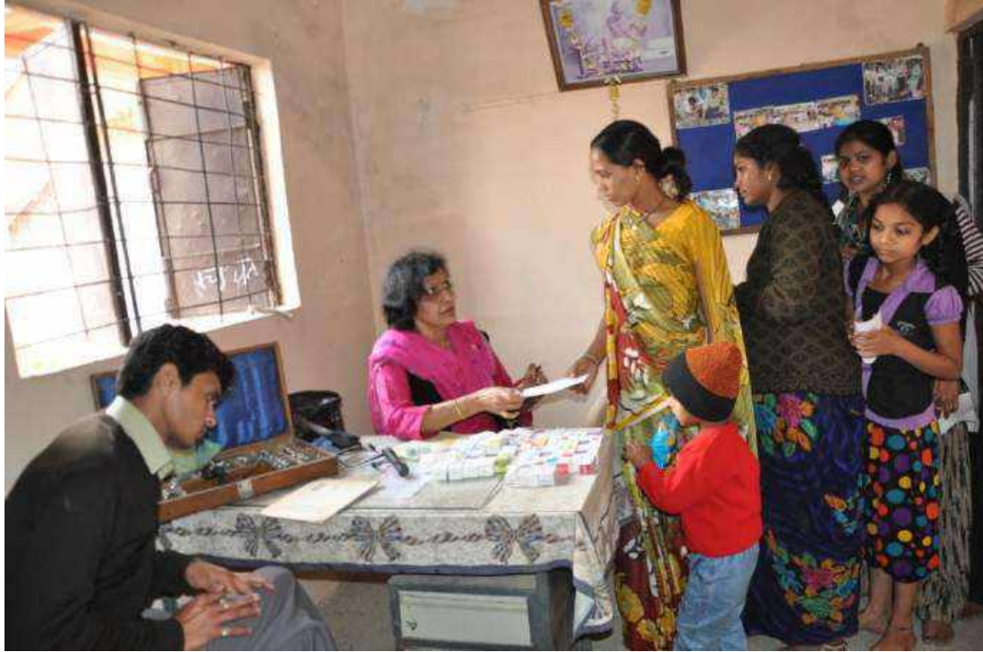
Picture: Eye report given to villagers