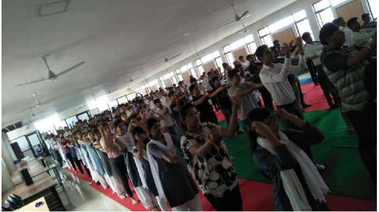
Picture: combined yoga session