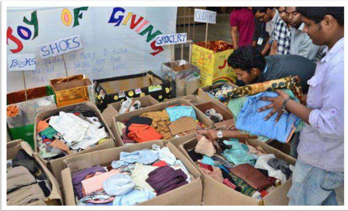
Picture : Collection of stuff for donation