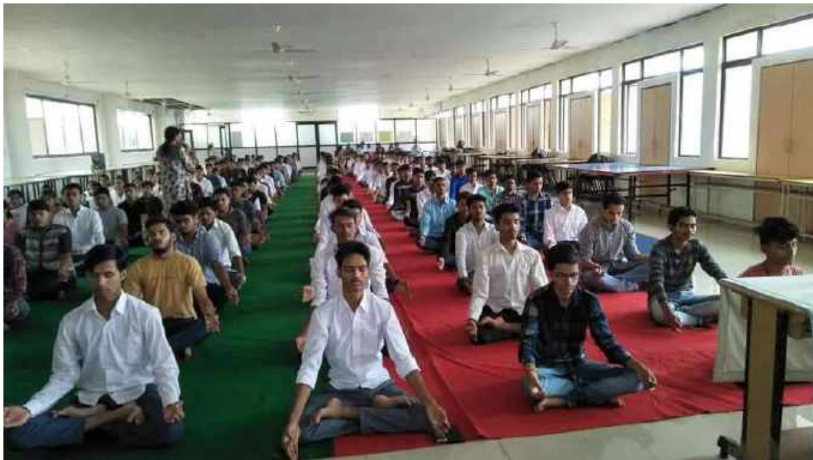
Picture : Stress management technique workshop for students