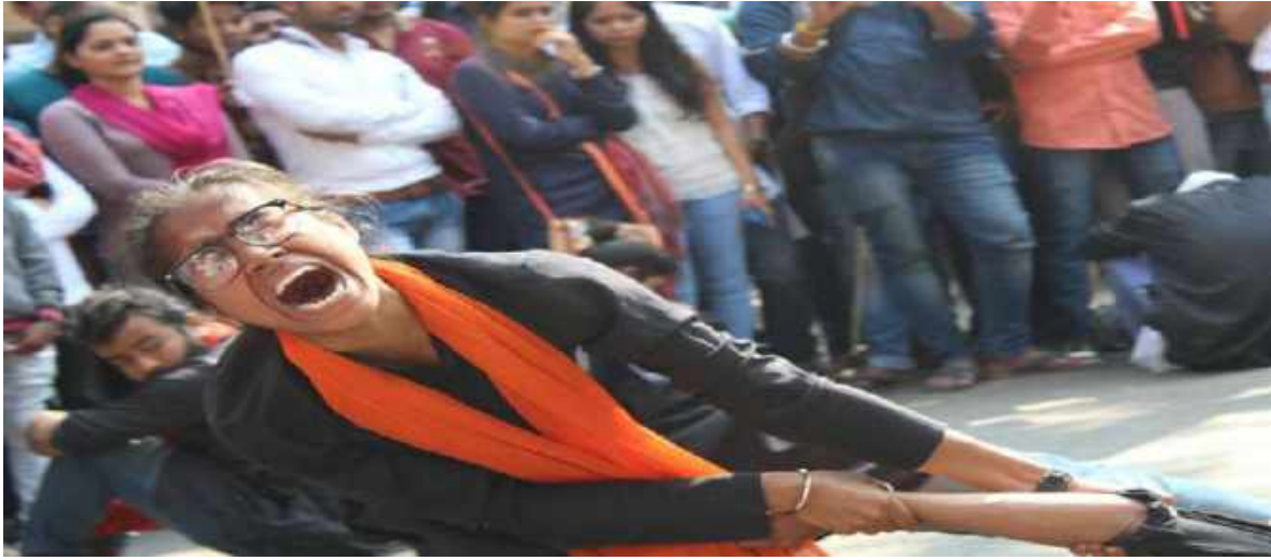
Picture : Nukkad Natak played at urban area square