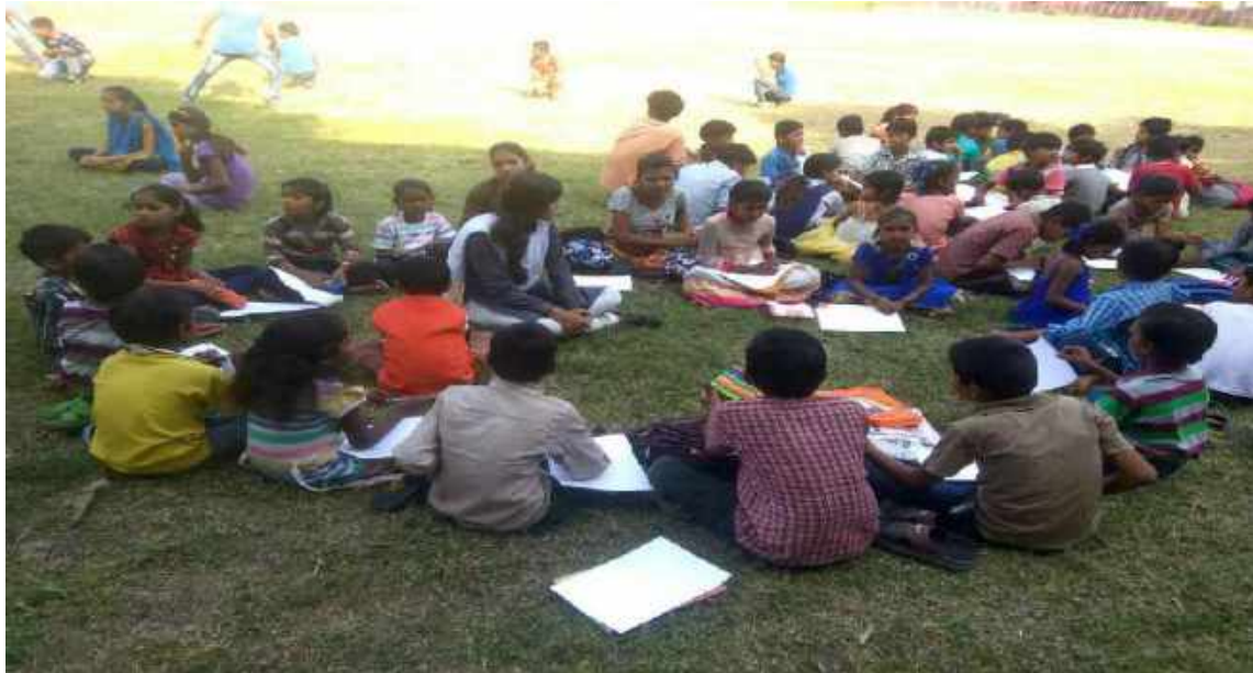
Picture : Student Volunteer organizing Extempore competition