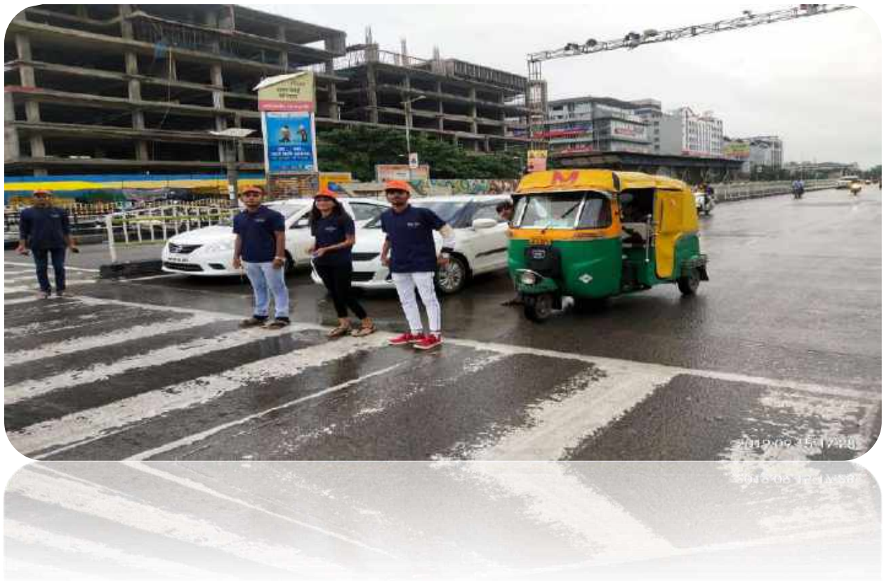
Picture :Student Traffic duty at Vijay Nagar Square