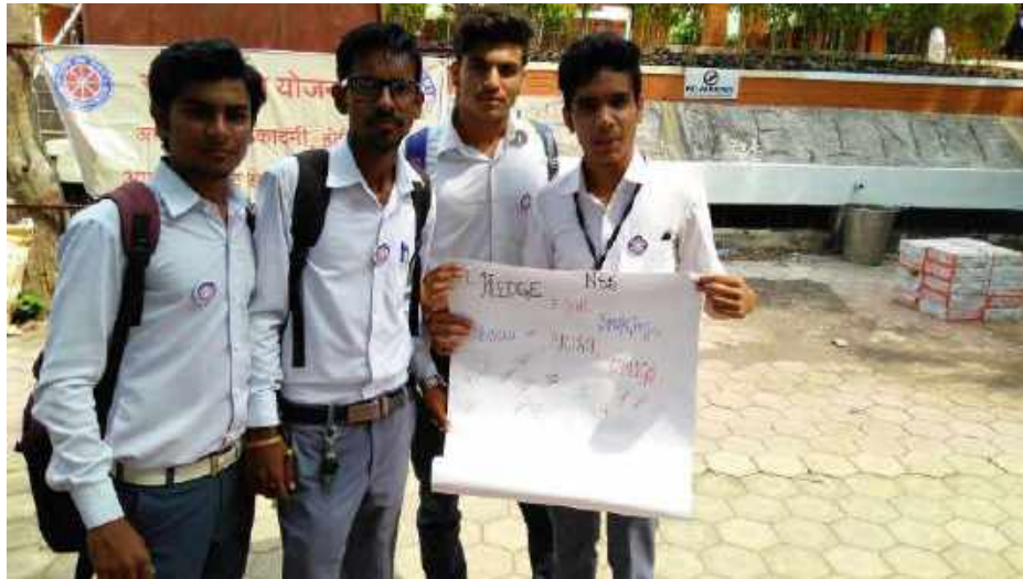
Picture :Students volunteer with a signature moment poster