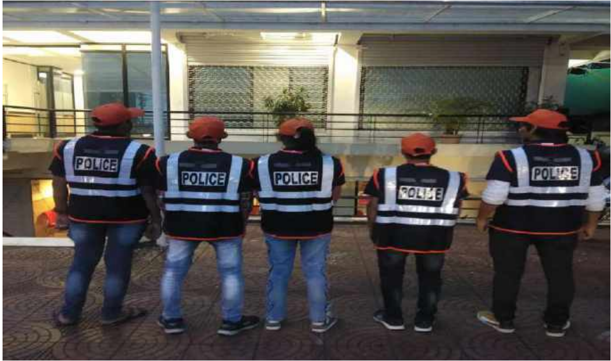
Picture : Students be dressed in traffic police jacket