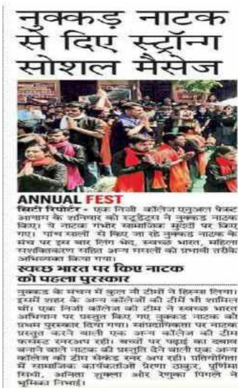
Figure 3 News on Street play on swachh bharat