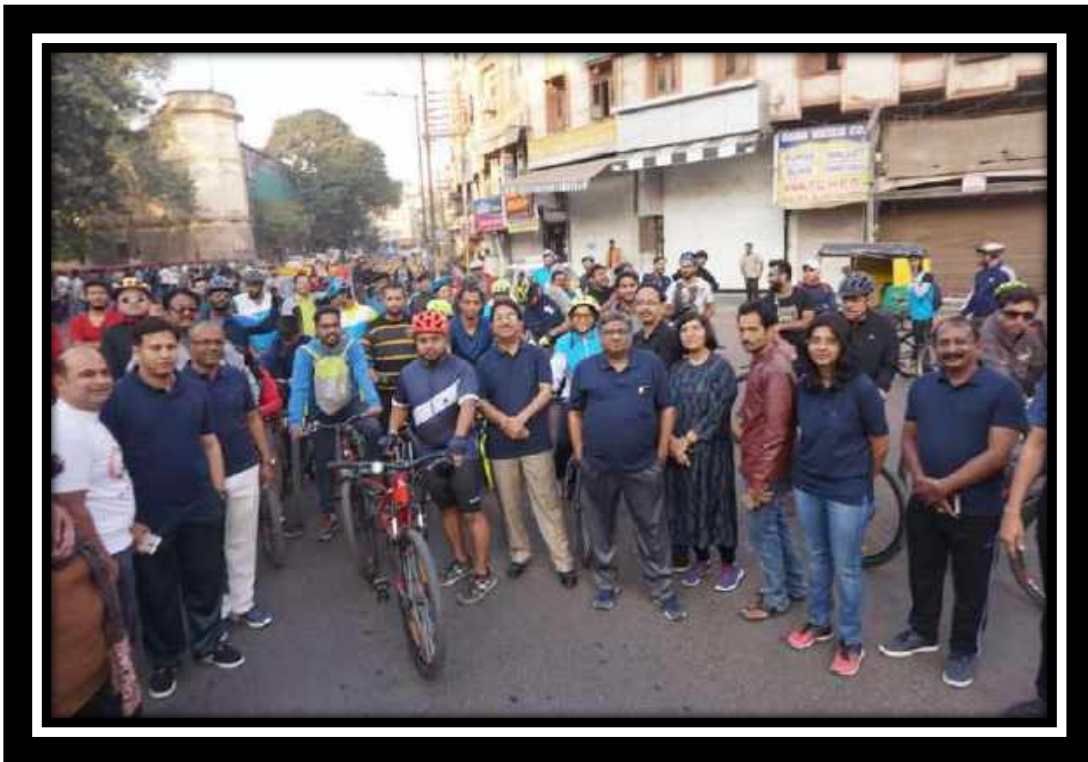
Picture : Students on Bicycle rally