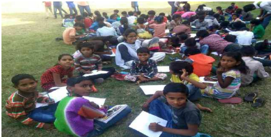
Picture :School student Essay competition