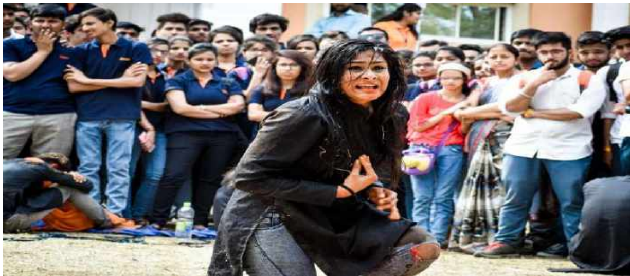
Picture: Student plays a victim girl role in nukkad natak