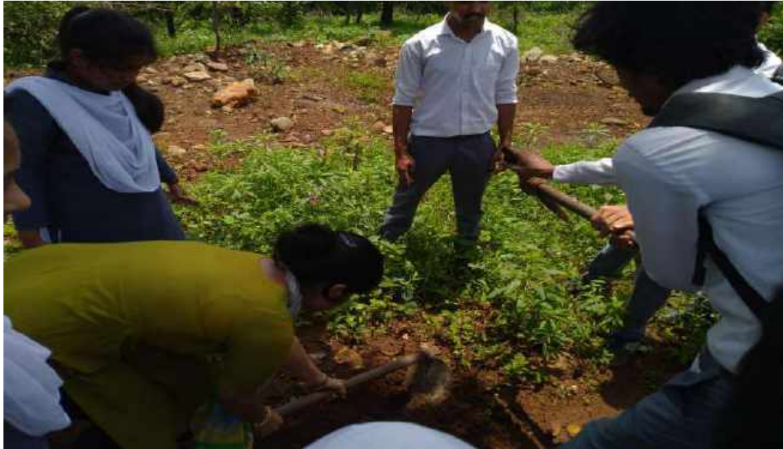
Picture: Digging for plantation