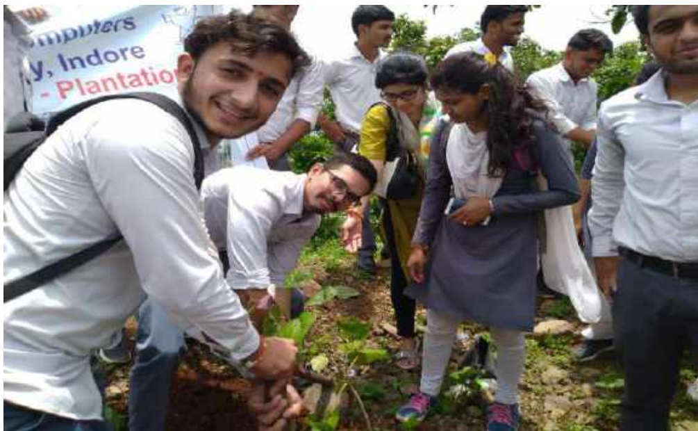
Picture: Plantation by volunteers