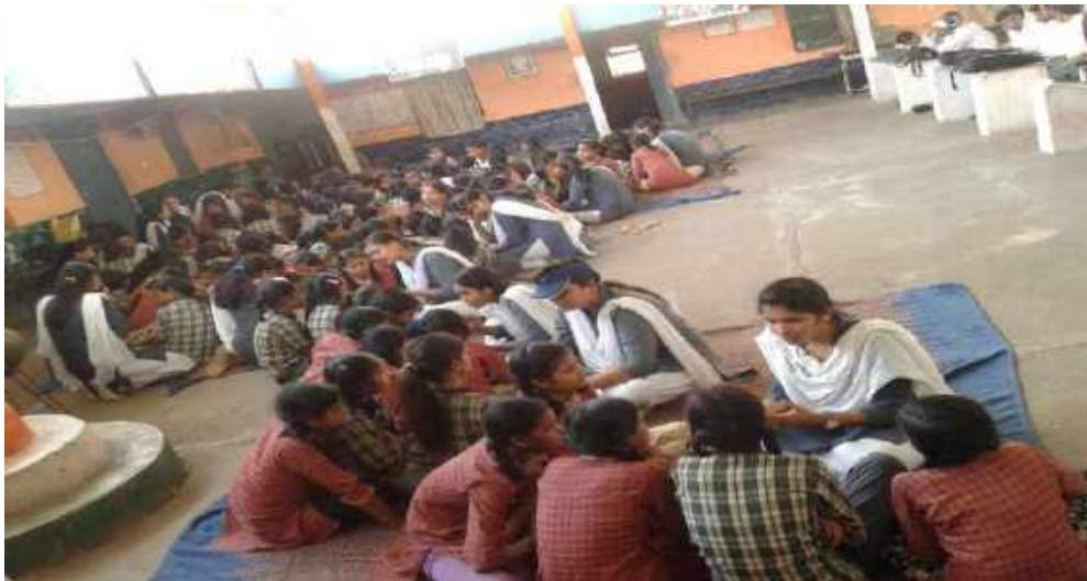
Picture : Students at digital India awareness program