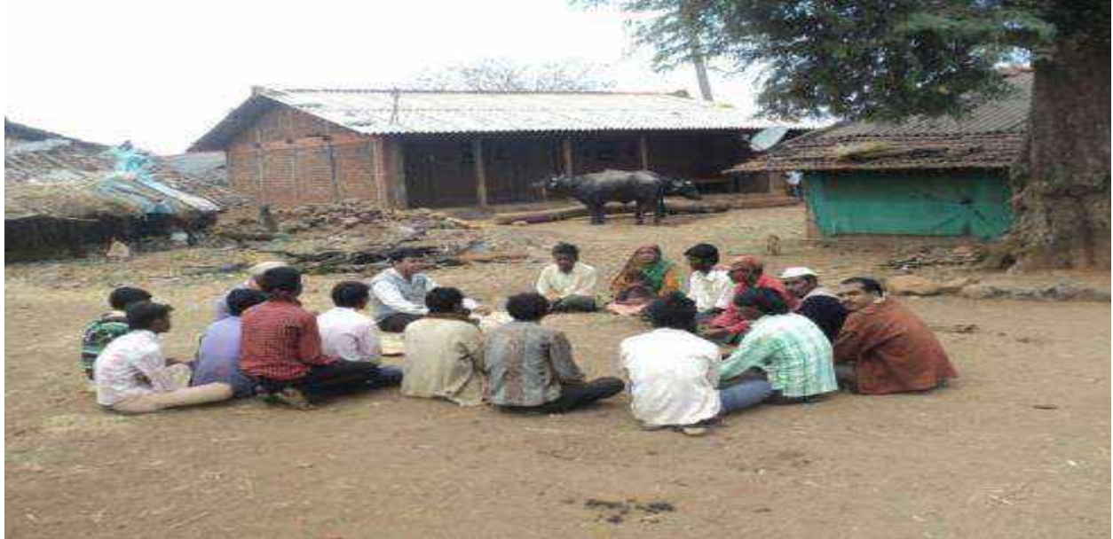
Picture: Expert talking with villagers in a group to illustrate the bad effects of drug abusing and addiction