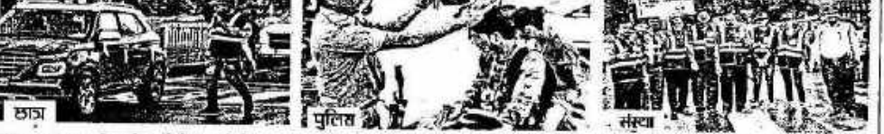
छात्र: कार स्टॉप लाइन से आगे आई तो छात्र ने रोक। पुलिस: गाड़ी में टंग था हेलमेट, निसे क्लक को पहनाया। संस्था: दिवाकर जैन सोशल ग्रुप में न के सहितल हुआ।