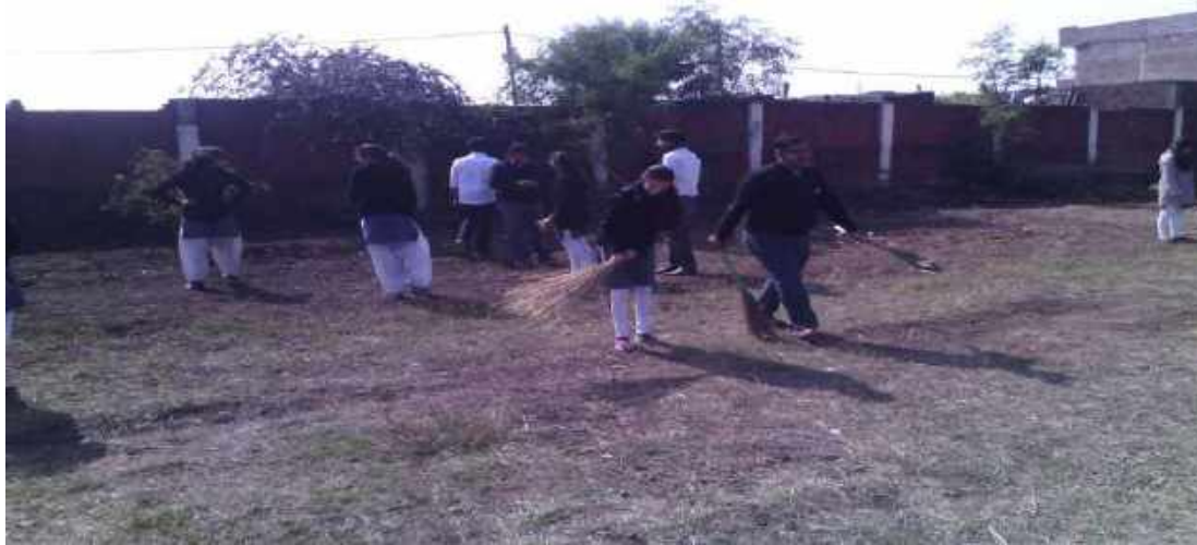
Figure 2 student cleaning campus