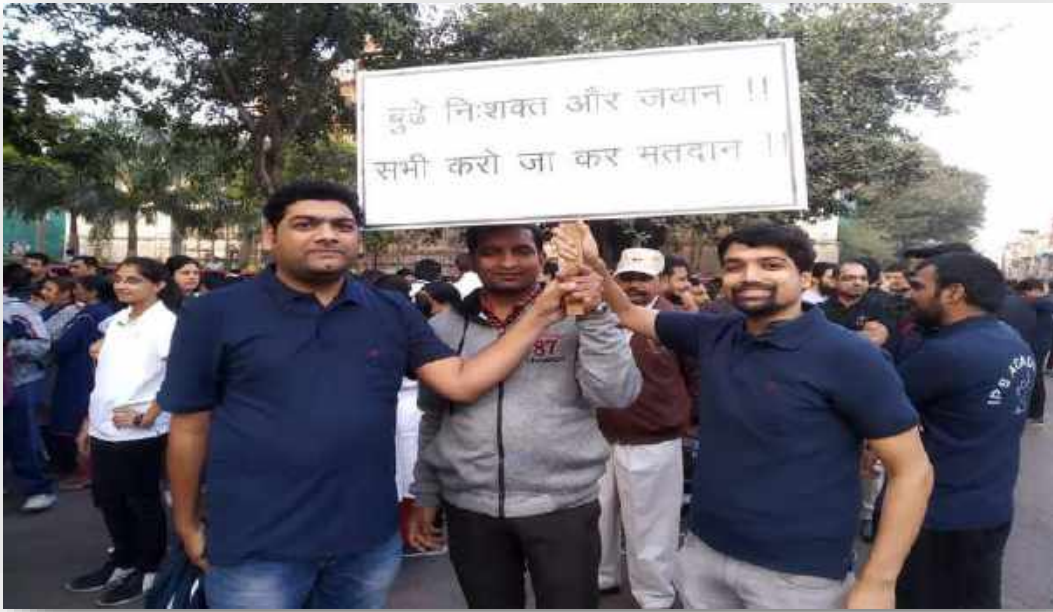
Picture : Faculty Of Engineering holding banner