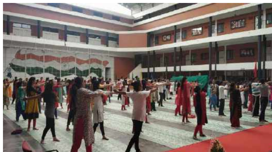
Picture : Yoga Poses by students and teachers