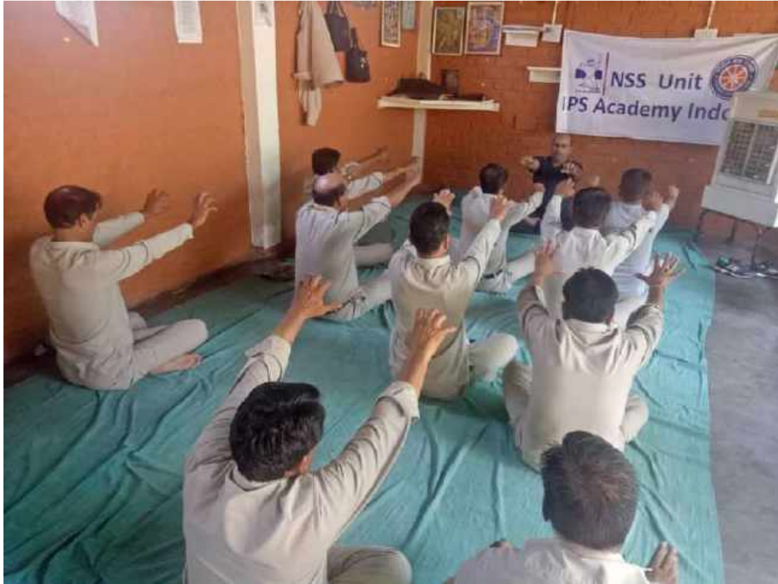
Picture: Drivers performing yoga poses