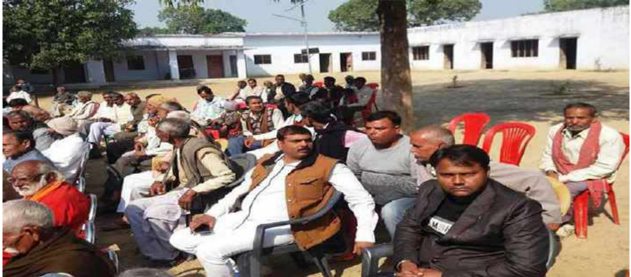
Picture : Villagers attending the Financial Literacy awareness Camp