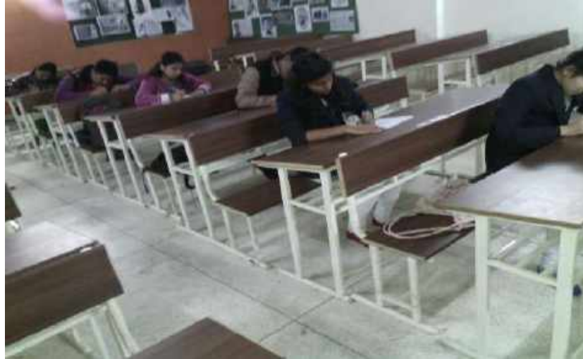
Picture: Essay writing competition on Swachh Bharat