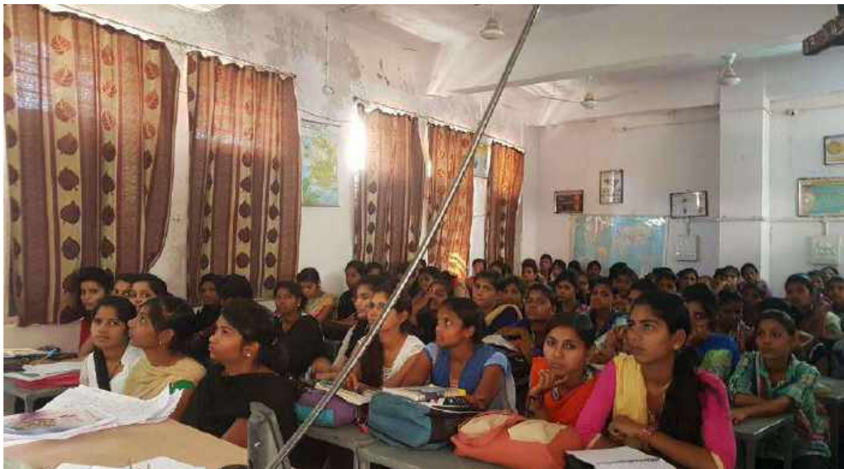
Picture : Spreading Awareness about Sanitation, Hygiene & Health at village school