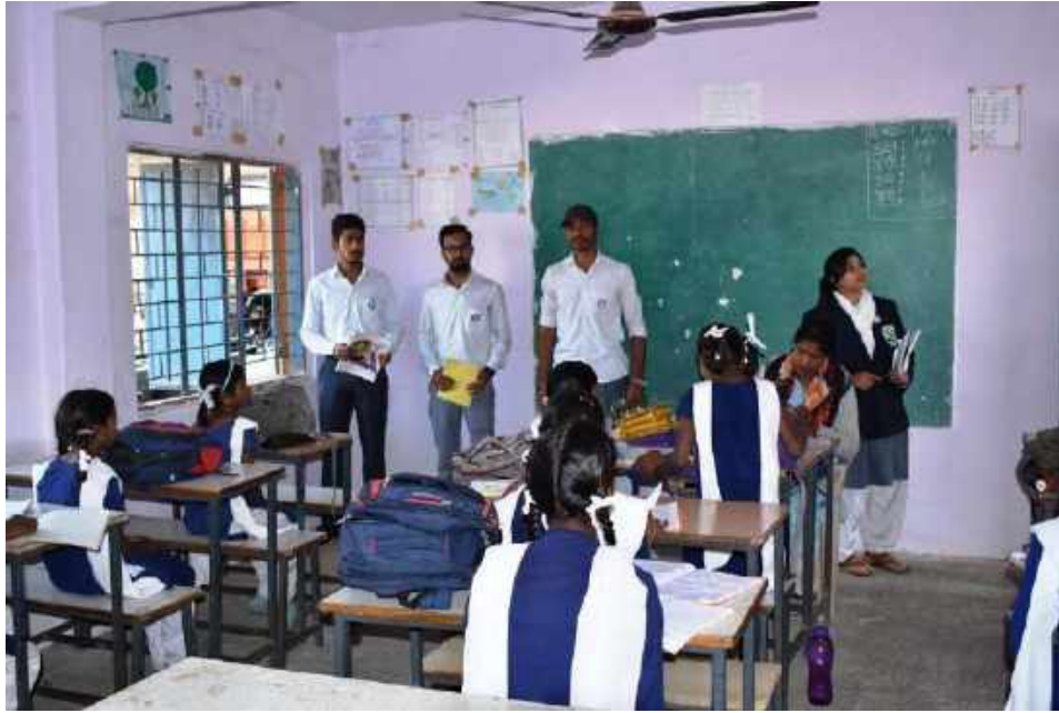
Picture : Students attending the digital India awareness program