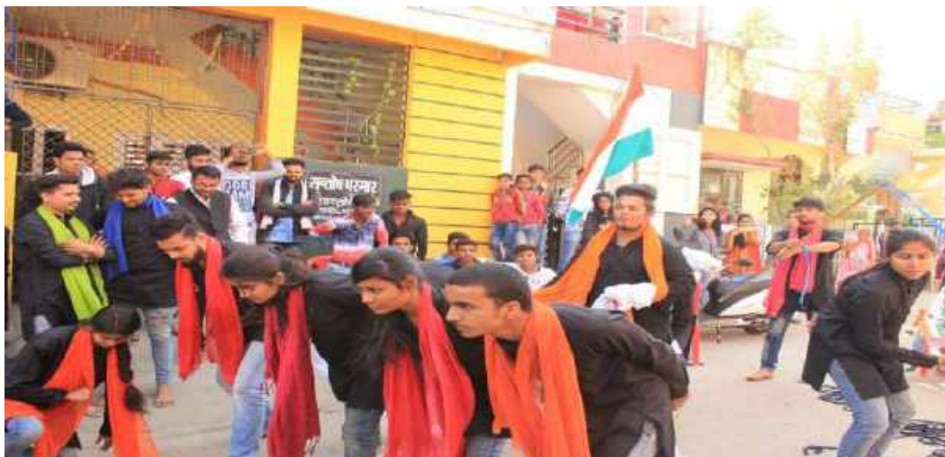
Picture : Through Street play student reflecting about financial security