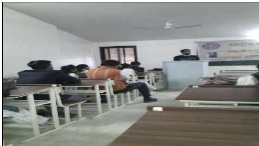
Picture: Student giving presenting view on swachh bharat