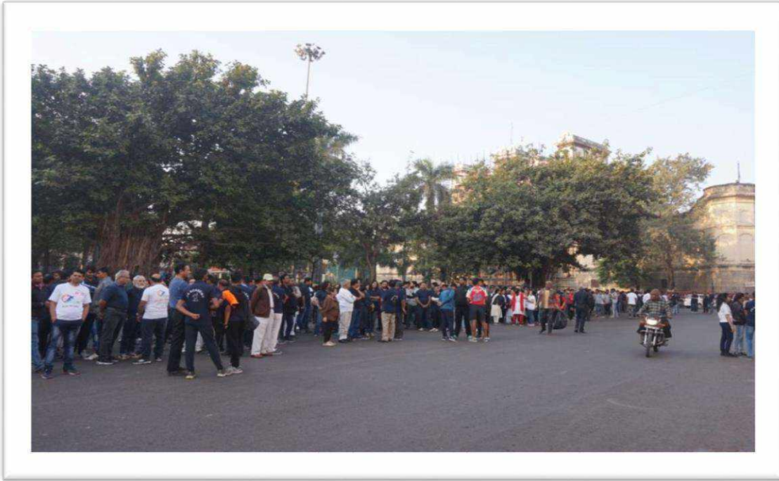
Picture : Morning gathering for Rally