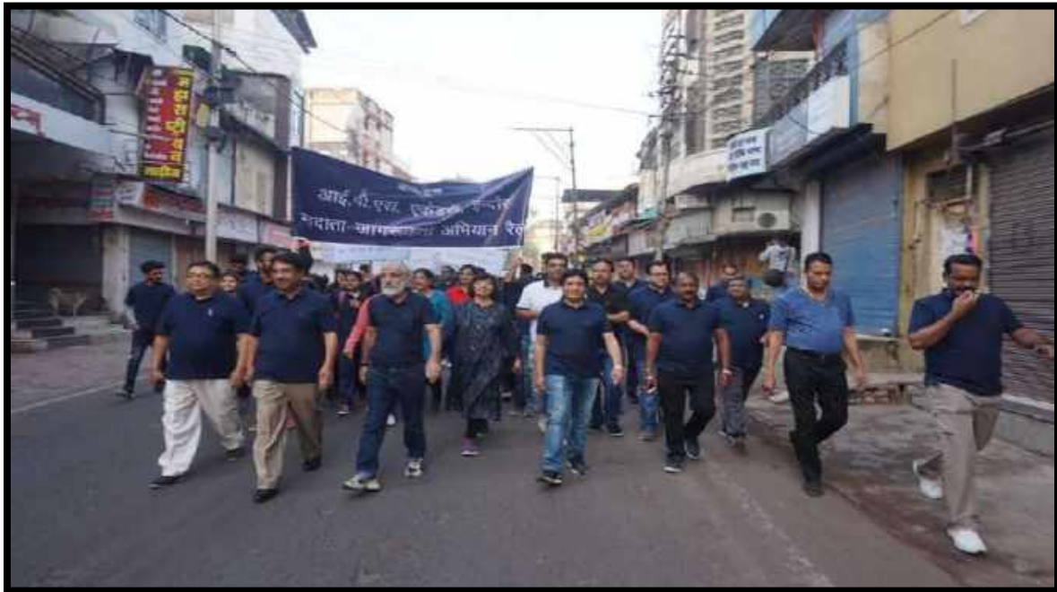
Picture : Rally Leading by Head of the Institutions