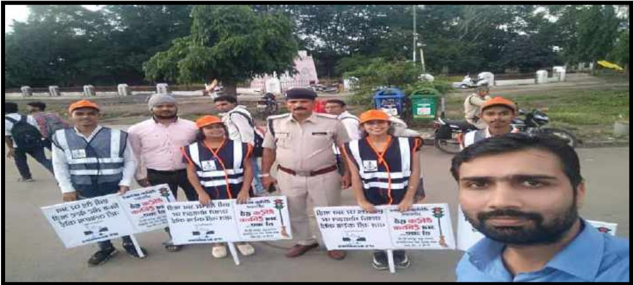
Picture :Traffic Duty at square with police