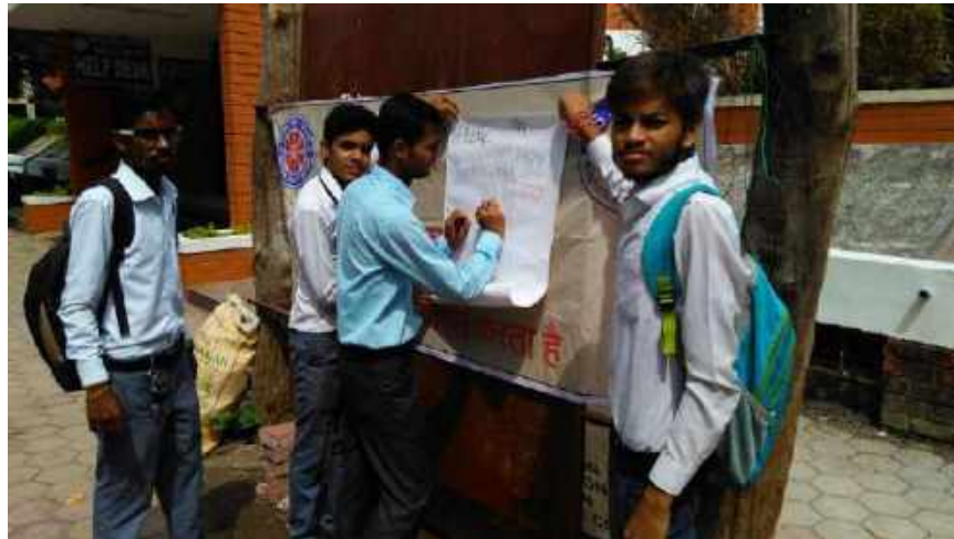
Figure: Faculty member inauguration moment by signature