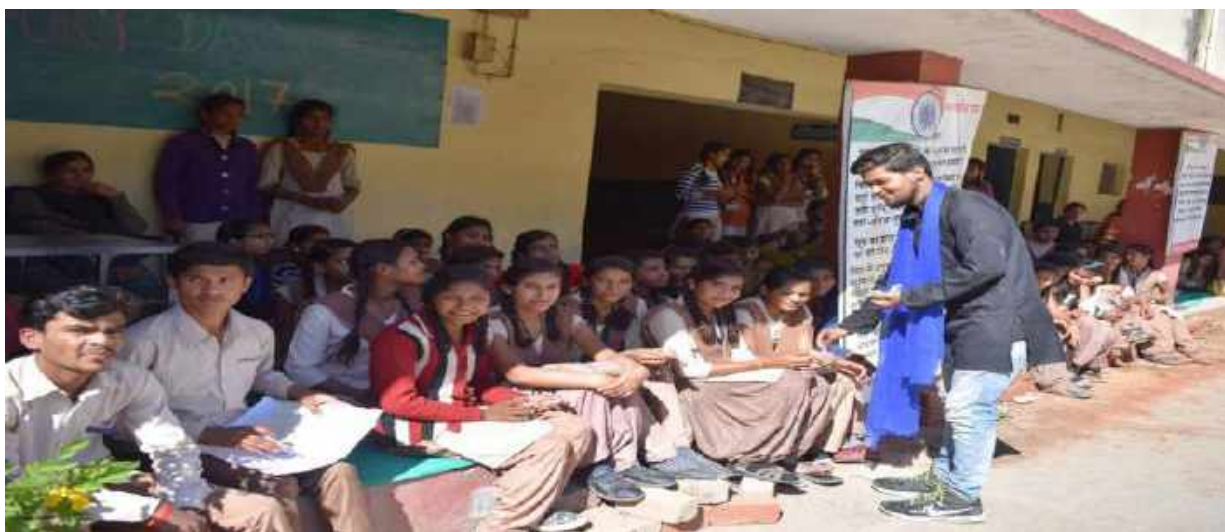
Picture : a student interacting with Govt.School student before Nukkad natak