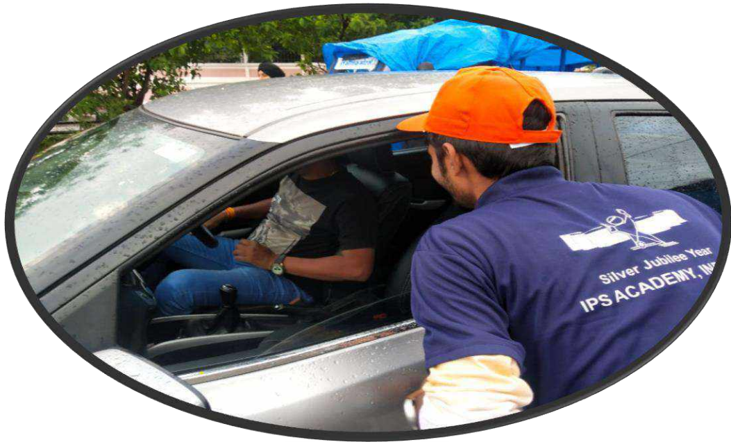
Picture : Student Request to Person for wearing Seat belt