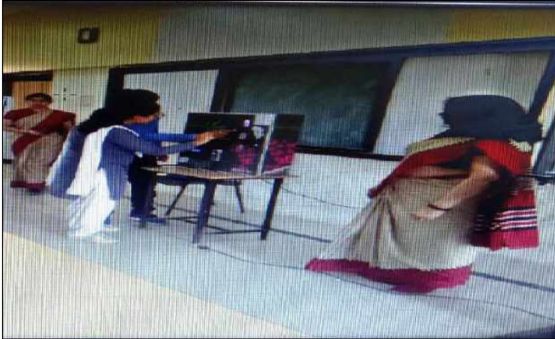
Picture : Installation of sanitary napkin vending machine