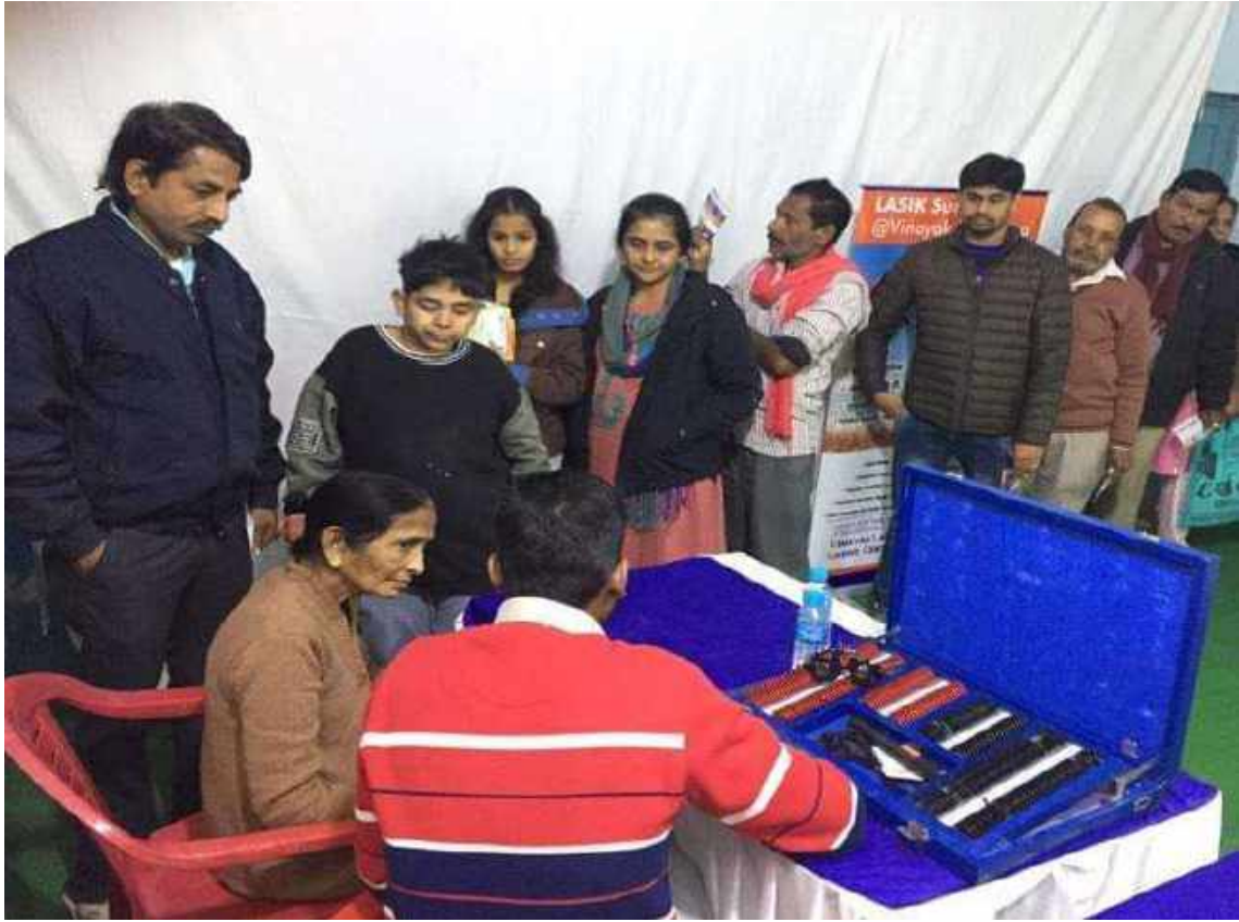
Picture : eye check up of staff member and family members